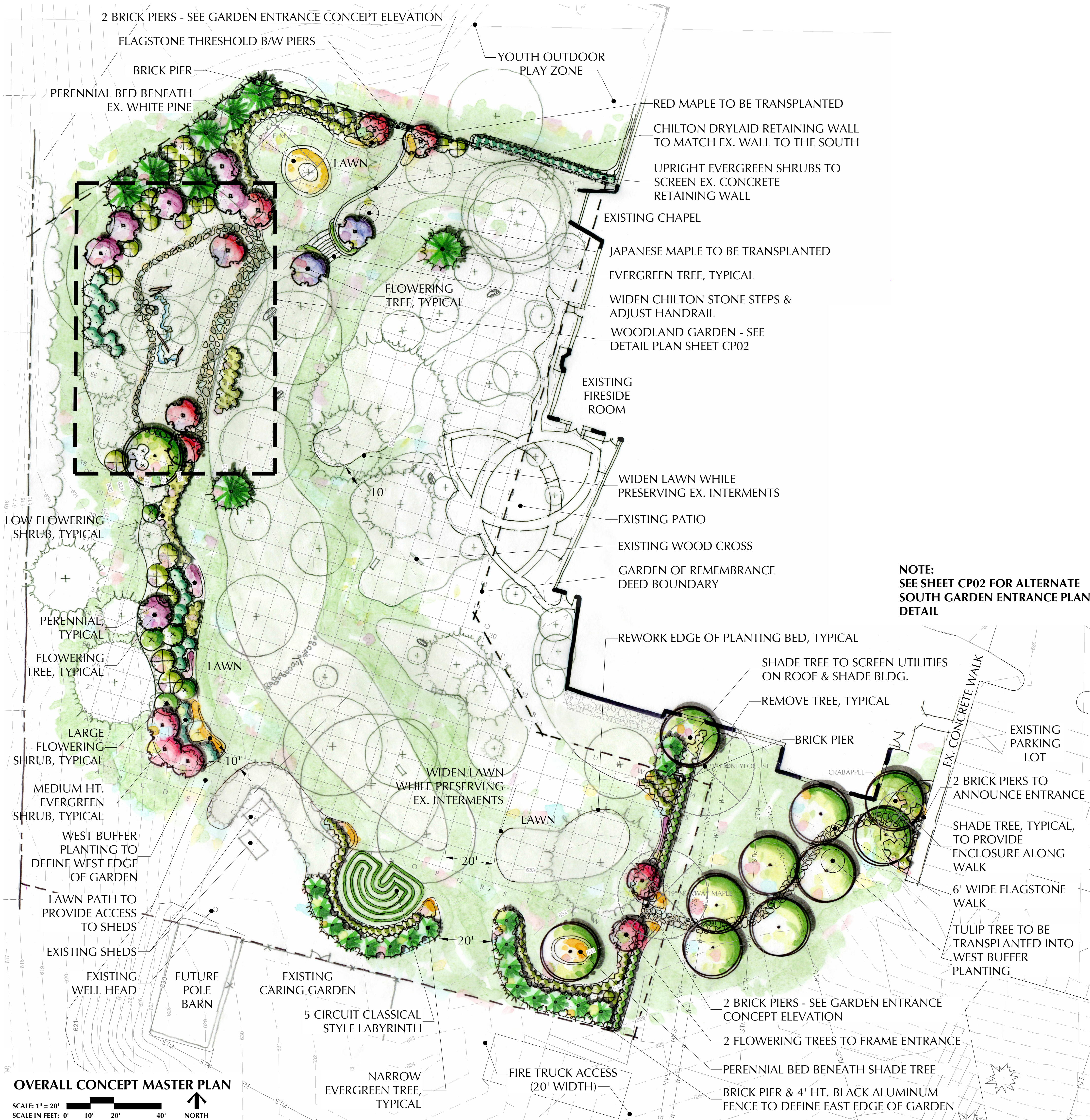
OVERALL CONCEPT MASTER PLAN

SCALE: 1/2" = 1'-0" SCALE IN FEET: 0' 1' 2' 4'