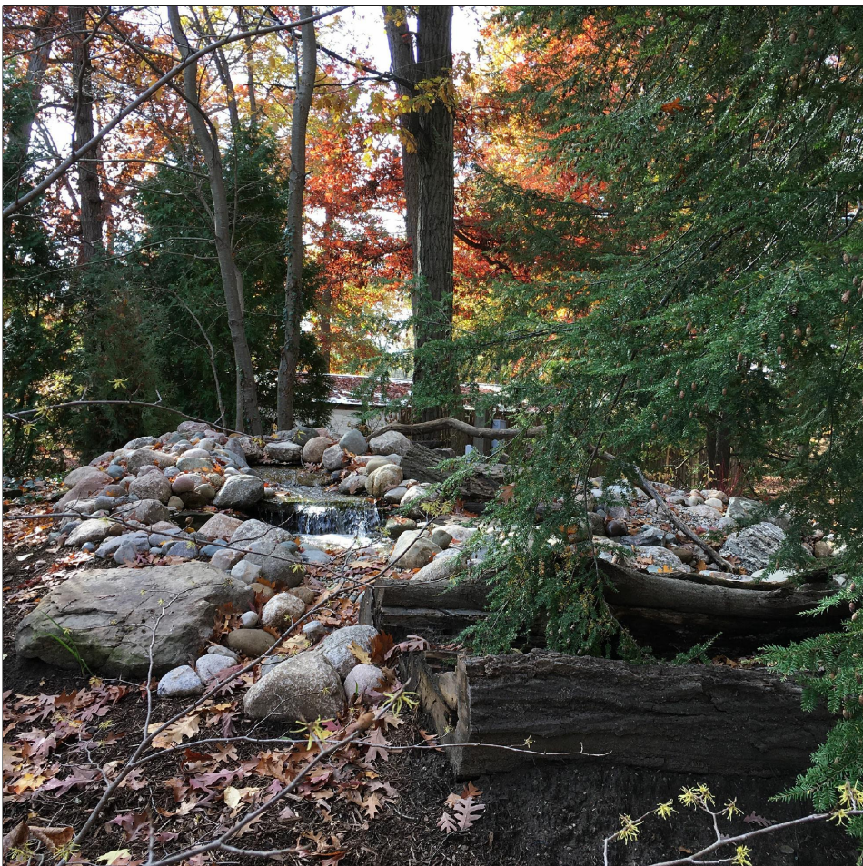
Beginning of woodland stream