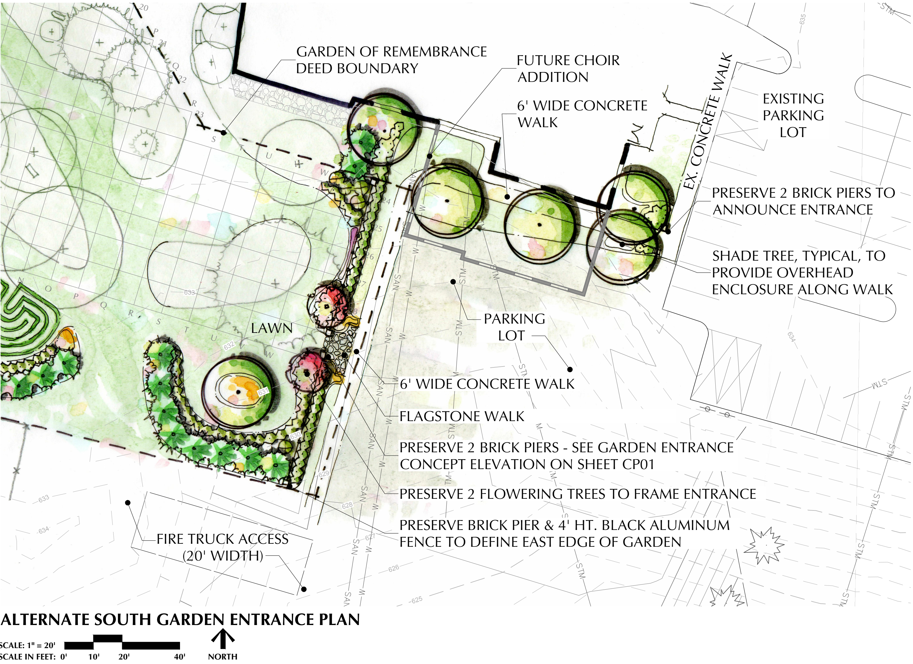
ALTERNATE SOUTH GARDEN ENTRANCE PLAN