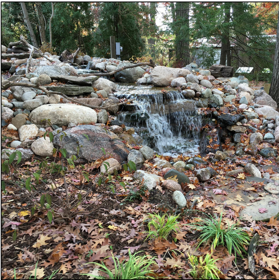
Disappearing stream & waterfall